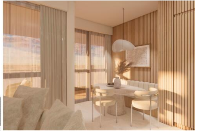
CUISINE + SA MANGER