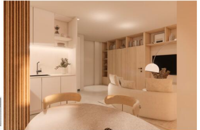
CUISINE + SA MANGER